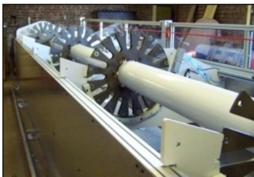
Photo of the 13 metre long tube drilling machine