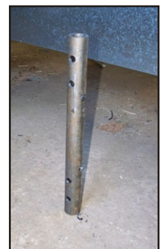
Photo of the finished product