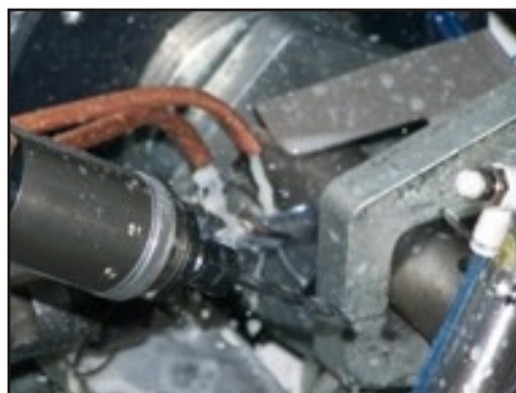
Photo of the drilling operation